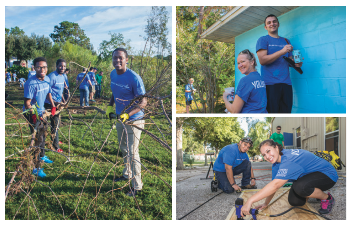
More than 4,800 Lockheed Martin employees volunteered at more than 140 events around the world during the Month of Giving in October. Lockheed Martin also raised more than $9 million through workplace giving campaigns.

prepare their pilots for fifth generation platforms like the F-35. If all options are exercised, this agreement would be the largest training contract to date for the training business in Mission Systems and Training, and supports our international growth strategy in Australia.