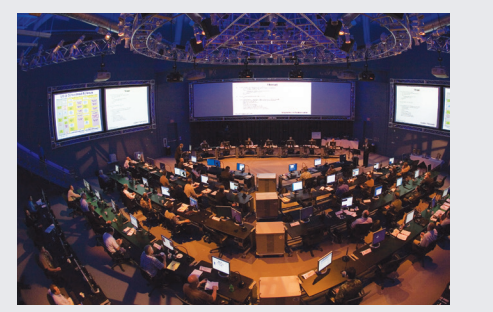
Sector 4 - Mobjack