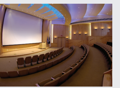
Sector 2 - Thimble Shoal Auditorium