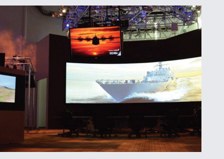
Sector 5 - Chincoteague